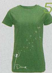
10 sleepyheads catch this Tees for Change DREAM bamboo tee. $32 (S-XL)