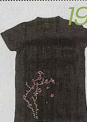
4 join the cause with OneTribes' original limited edition tee. $39 (S-M)