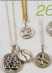
7 unwrap an EcoChic recycled sterling charm from Presents For Purpose. $57-$117