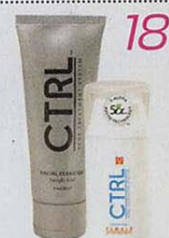
10 will be in the clear with this acne treatment system from CTRL. $60