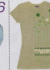
10 country cuties win Farm Girl Brand's Farm Girl "Organic Girl" Jr. premium tees. $29 (L-XL)