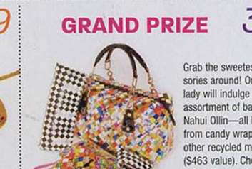
Grab the sweetest accessories around! One lucky lady will indulge in an assortment of bags from Nahuio Ollin—all handmade from candy wrappers and other recycled material ($463 value). Check out nahuioollin.com for more earth-friendly finds.