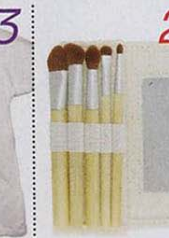
10 flirty femmes bat eyes with a six-piece eye brush set from EcoTools. $8