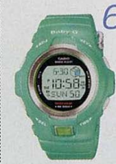
1 busy babe stays green sporting an Eco Baby-G watch by Casio. $99