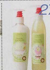
2 shine with Ec-oooh-Chic's Bohemian Blue Duo organic body wash and lotion set. $38