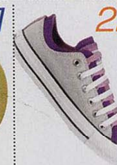
3 win Journeys Converse All-Star Double Upper Oxford sneakers. $50 (6-11)