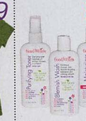
5 stay naturally gorgeous with a trio of organic products from Good For You Girls. $43