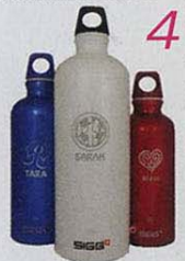
5 aqua chicks grab a customized SIGG water bottle from greensender.com. $28