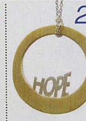
10 dreamers wish for this Shade Art "Hope" necklace from Bridy Designs. $39