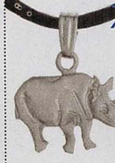
5 secure a silver pendant from the Cheeky Monkey Jewelry mini collection. $50