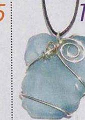
5 winners fly high with a recycled glass pendant from Space Mermaid. $20