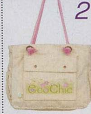
6 sunny sistahs carry an Eco Chic organic tote by Dandelion Earth-Friendly Goods. $50