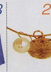
15 beach bums collect a Shoreline bracelet by SarahAghill.com. $14