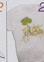
6 chicks do as they please with this Eco-Chic tee from Just Be. $24 (S-2XL)