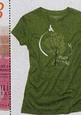
10 keep the peace with a BGreen Apparel organic tee in Peace. $30 (S-XL)