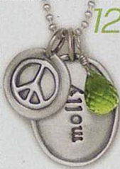
1 gem wins a custom charm necklace from Heart & Stone Jewelry. $240