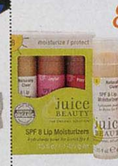
5 winners pucker up to a set of SPF 8 lip moisturizers from Juice Beauty. $15