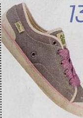
3 satirical sweetsies kick back in Simple's Satire sneakers from Journeys. $55 (6-10)