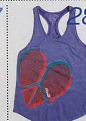
10 gals will give tanks and spread the love with O'Neill's RGB Love tee. $24 (XS-XL)