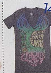
10 superwomen get a Saving the Earth shirt by Revenge Is. $32 (S-L)