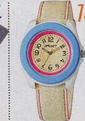
5 readers keep time with this natural bamboo and corn resin watch from Sprout. $30