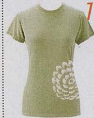
10 sport Earth Creations' clay-dyed organic cotton ladies tees in Petals. $25 (S-XL)

TO ENTER • Log on to girlslife.com . • Look for the GIVEAWAY OF THE DAY box. • Click ENTER NOW. • Check the WINNERS LIST each Friday. • ENTER AS MANY TIMES AS YOU WANT! • U.S. residents only.