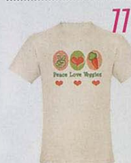
5 lovely ladies dig up a Peace, Love, Veggies organic T-shirt from CafePress. $26 (S-XL)