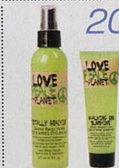
5 pretties look styling with TIGI Love, Peace and The Planet hair care. $59